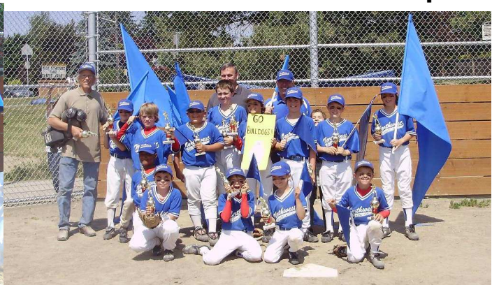
Minors Champions - Broderick Architects