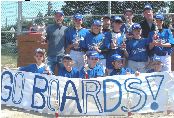
Majors Champs – Seattle Ski and Board